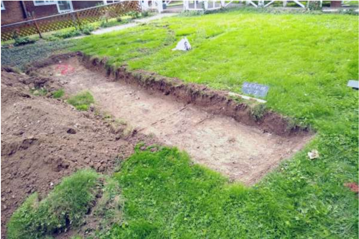
Plate 5: Looking south-west at trench 2