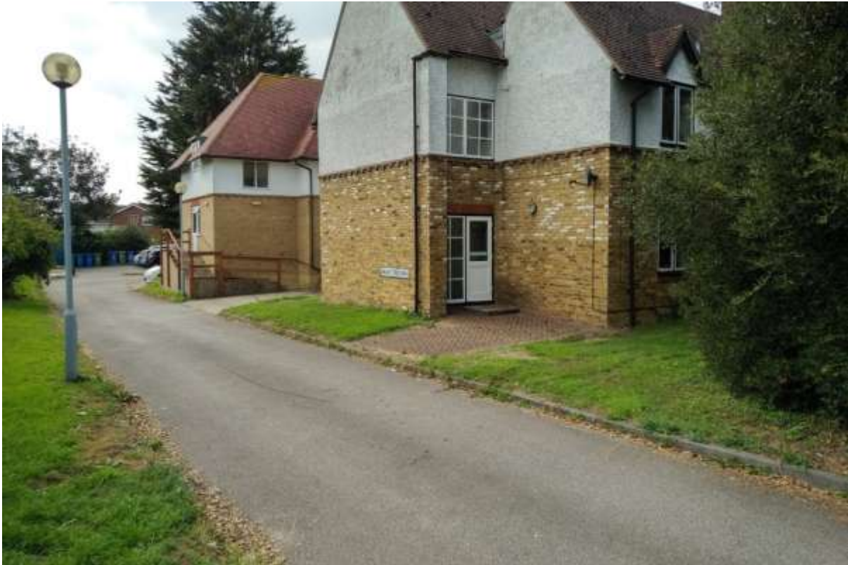
Plate 1: Looking south west at the site