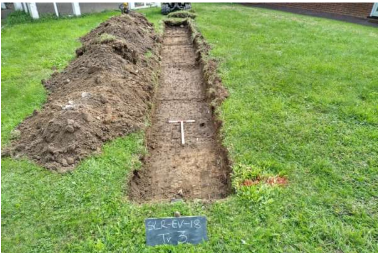
Plate 6: Looking south east at trench 3