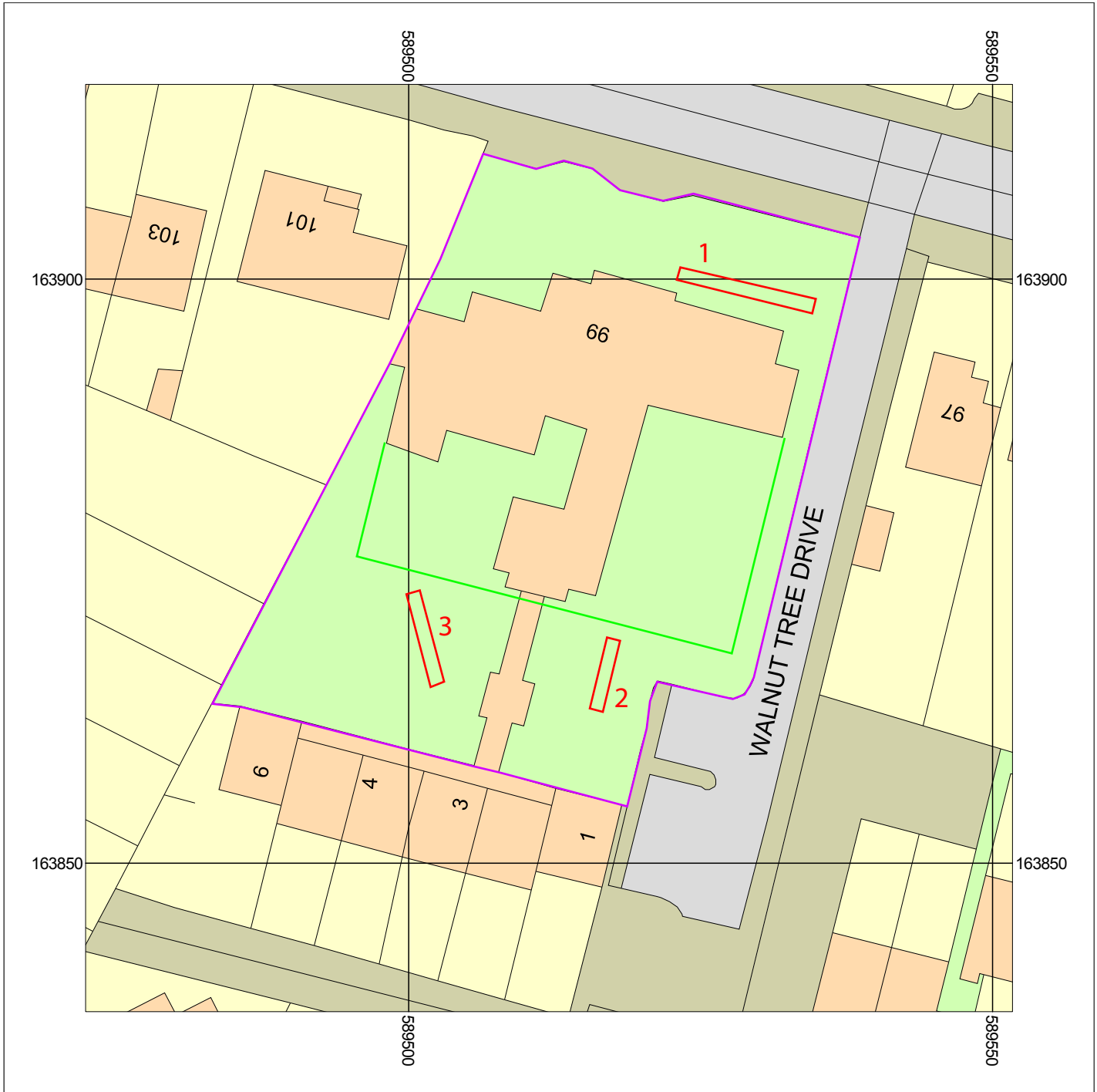
Figure 2 Trench Locations