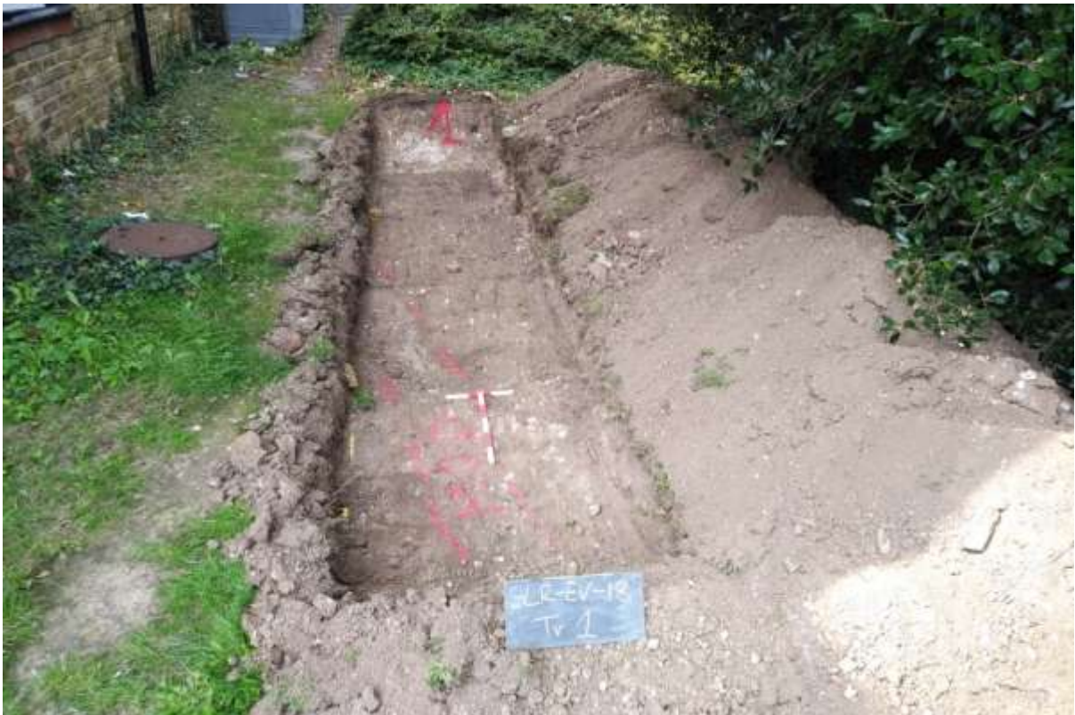
Plate 4: Looking west-north-west at Trench 1