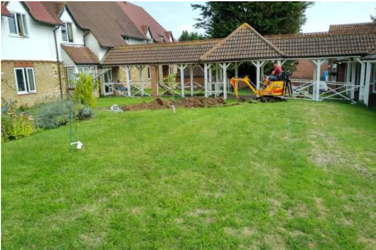
Plate 2: Looking east at the site during excavation of Trench 3