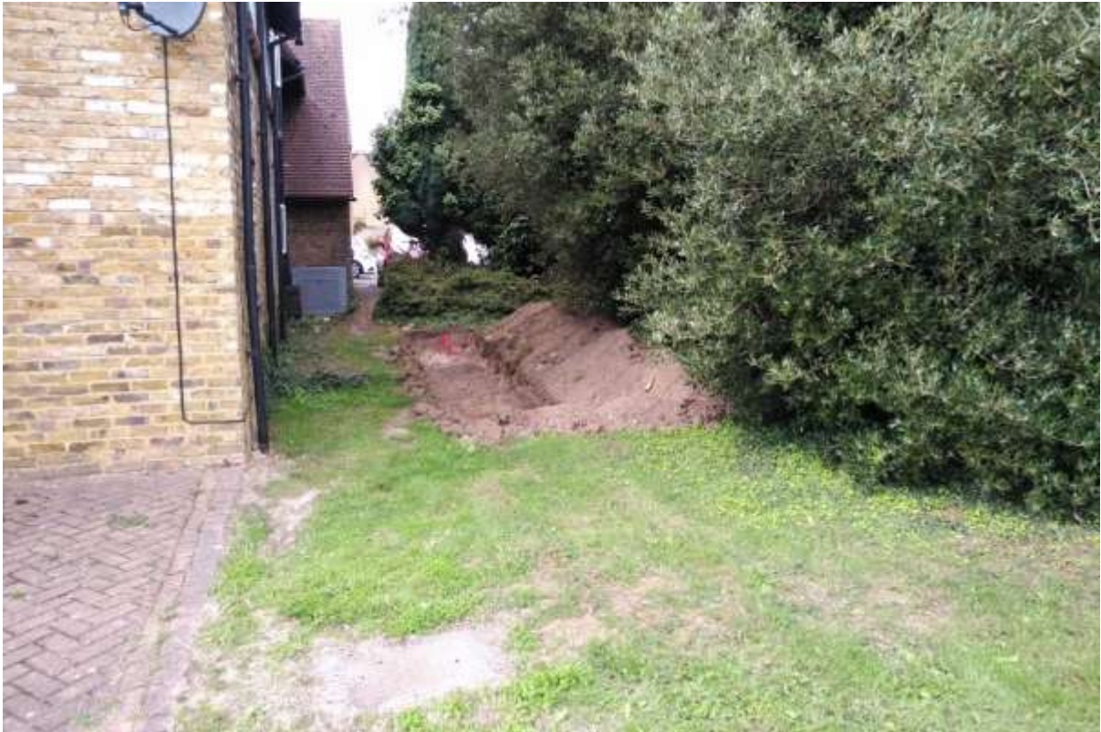
Plate 3: Looking WNW at the site of Trench 1